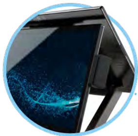
11.6" / 15.6" Customer Display with Accessories*