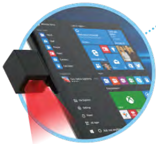
2D Barcode Reader