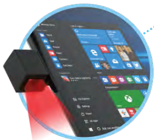
2D Barcode Reader