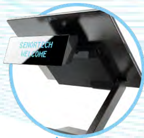
VFD Customer Display