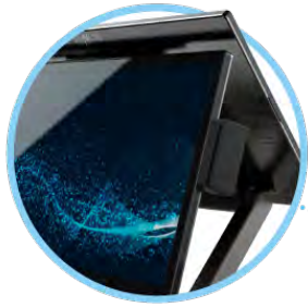
11.6" / 15.6" Customer Display with Accessories*