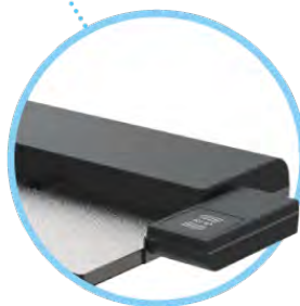
RFID / Fingerprint Reader