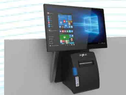
Wall Mount with Printer

* Customer display with accessories is by special order only.