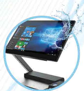
IP54 Whole Unit