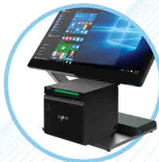
Integrated Thermal Printer*