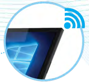
Wireless + Bluetooth