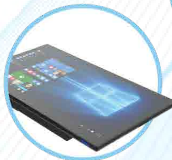
Ultra-thin 10mm Panel