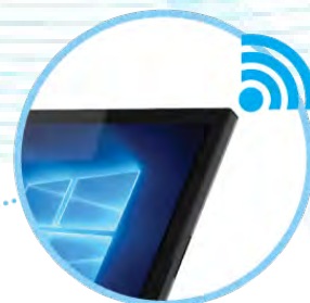
Wireless + Bluetooth