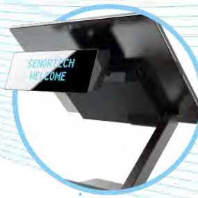
VFD Customer Display