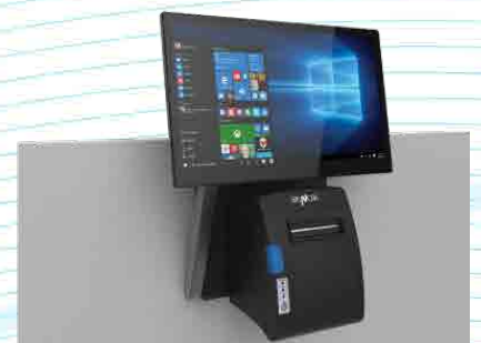
Wall Mount with Printer