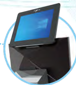
Upward Facing Display*