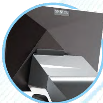
Aluminium Die-cast Sleek Enclosure