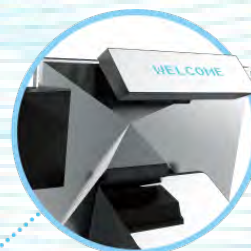
VFD / 10" / 15" Customer Display