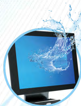
IP54 on Whole Unit (without Peripherals)