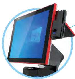
Coloured Frame* / Unit*