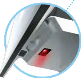
Integrated 2D Barcode Scanner