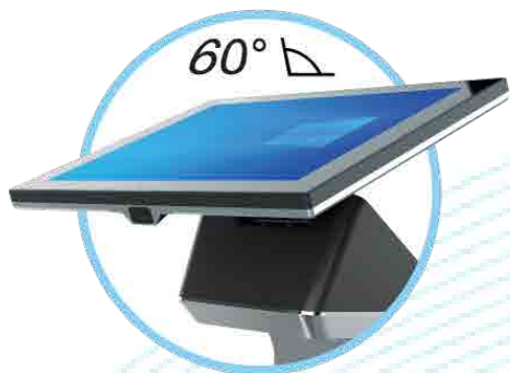
60 Degree Tilt Adjustment