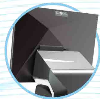
Fanless / Ventless / Screwless

* Coloured units are for special order only.