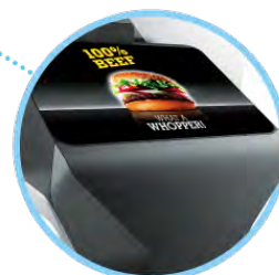
7" LCD / Customised Logo