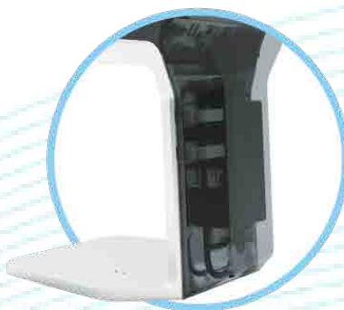
Internal Power Supply Powering POS & Printer