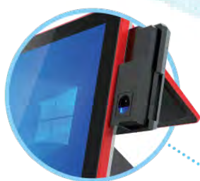
MSR / 2D Scanner / RFID Reader