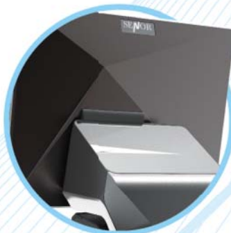
Aluminium Die-cast Sleek Enclosure