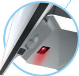
Integrated 1D Barcode Scanner