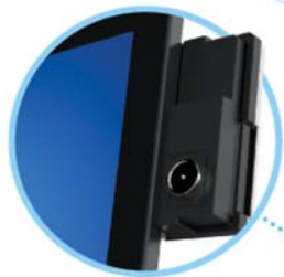
MSR / Fingerprint / RFID Reader