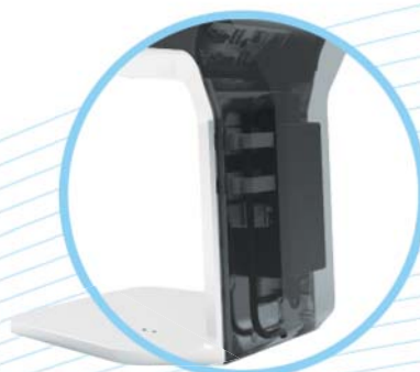
Internal Power Supply Cable Management System