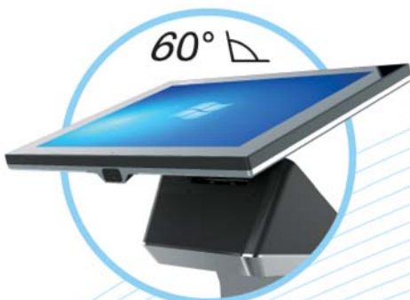
60 Degree Tilt Adjustment