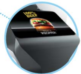
7" LCD / Customised Logo