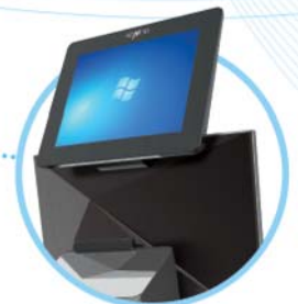
Upward Facing Display