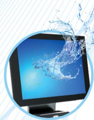
IP54 Whole Unit