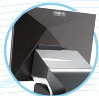
Fanless / Ventless / Screwless

* Coloured units are for special order only.