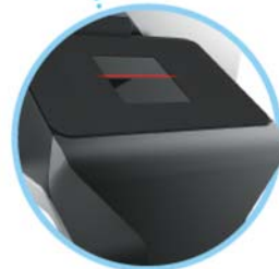
2D Barcode Scanner / RFID (NFC)