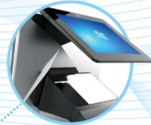
VFD / 10" / 15" Customer Display