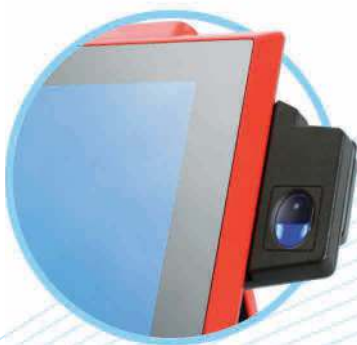
MSR / Fingerprint / RFID Reader