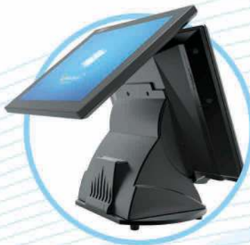
10" / 15" LCD Customer Display