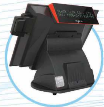
VFD Customer Display

* Optional configuration * Coloured units are for special order only.