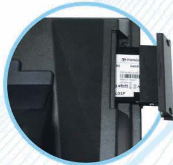
Removable SATA SSD