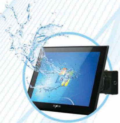
IP54 Whole Unit