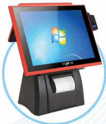
Integrated Printer # Space-saving