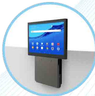
Wall Mount Capable*