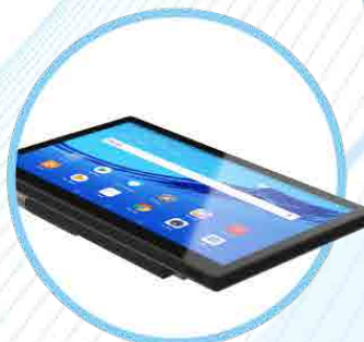
Slim 16mm Panel