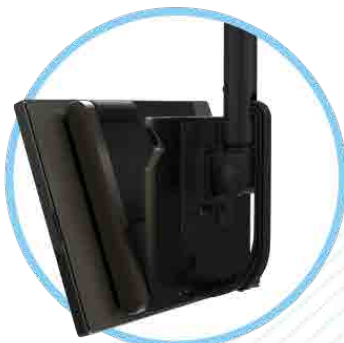
VESA Mount Capable*