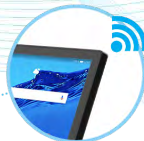
Wireless + Bluetooth