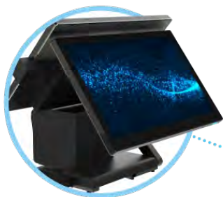
11.6" Customer Display with Accessories*