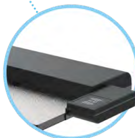
RFID / Fingerprint Reader