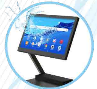
IP54 Whole Unit