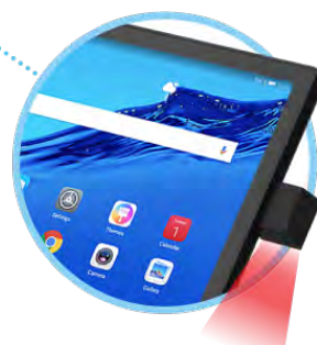
2D Barcode Reader