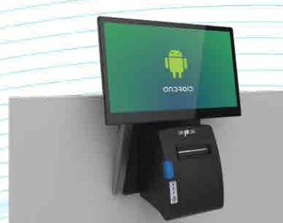
Wall Mount with Printer

* Customer display with accessories is by special order only.