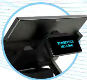
VFD Customer Display